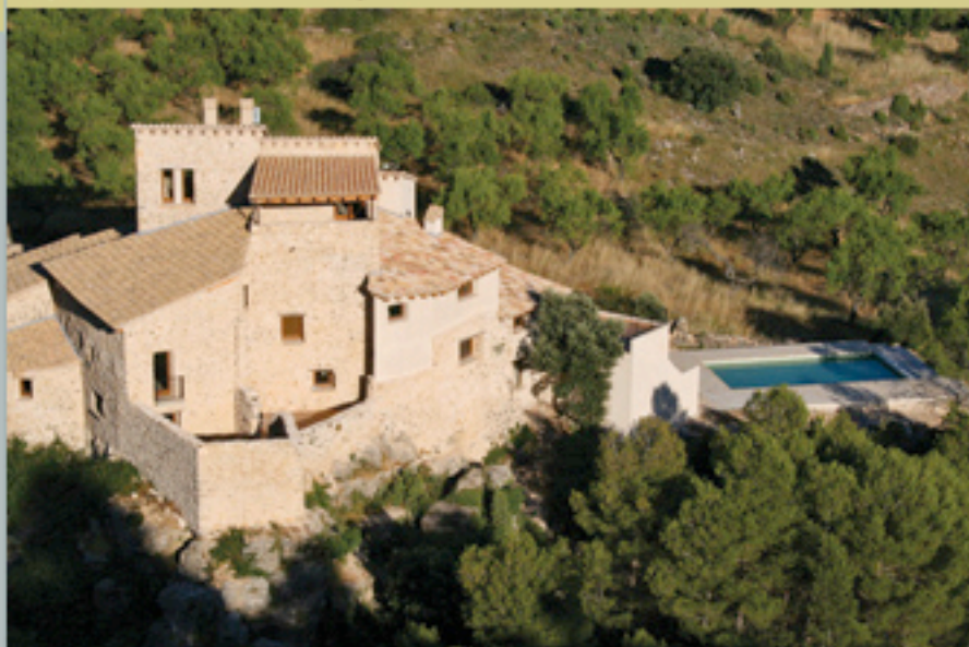
Mas de la Serra