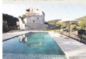
HOTEL MISSIONI, ALTISSIMO IN LISBON

Contains of shed atop ravello, Vila is, has for through its, acquired thorp in Bedroom reel air of ata Garbo Hollywood ski, which dons and whimsical courtyard,