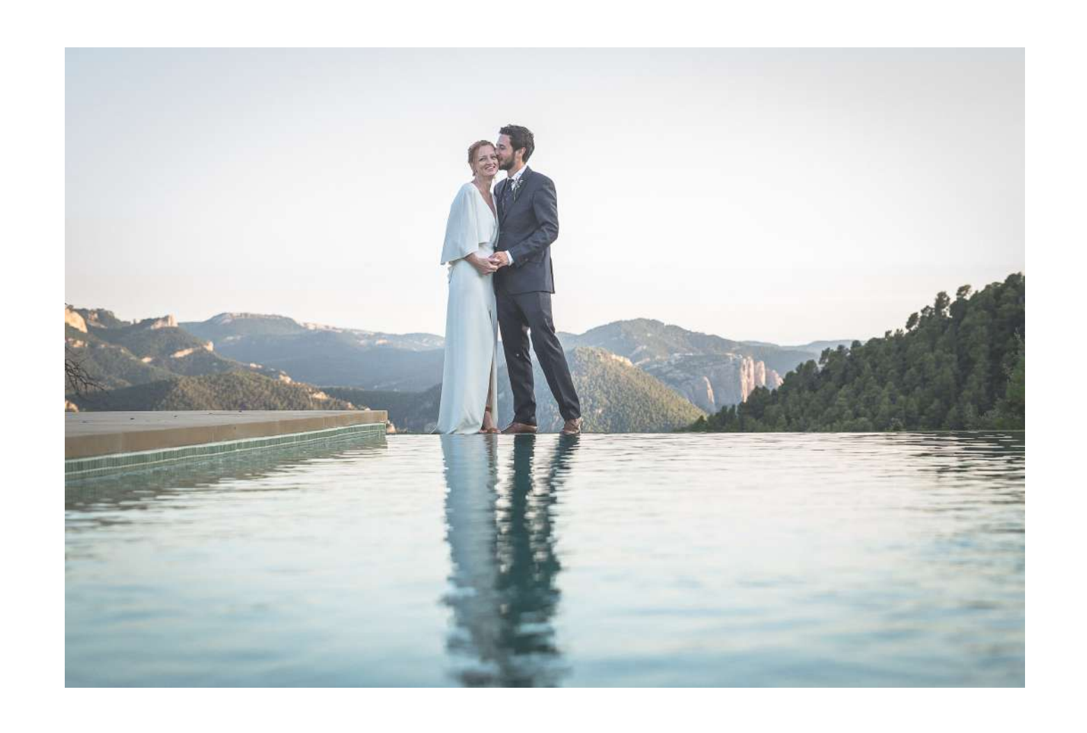
Wherever you go, go with all your heart