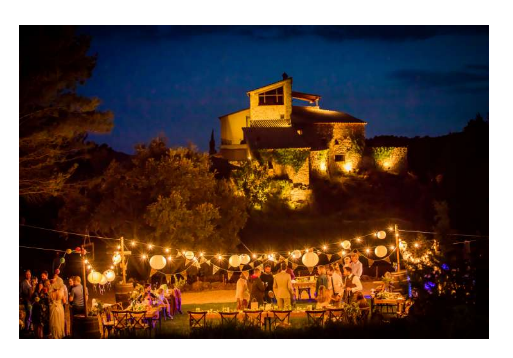
Where there is love there is life