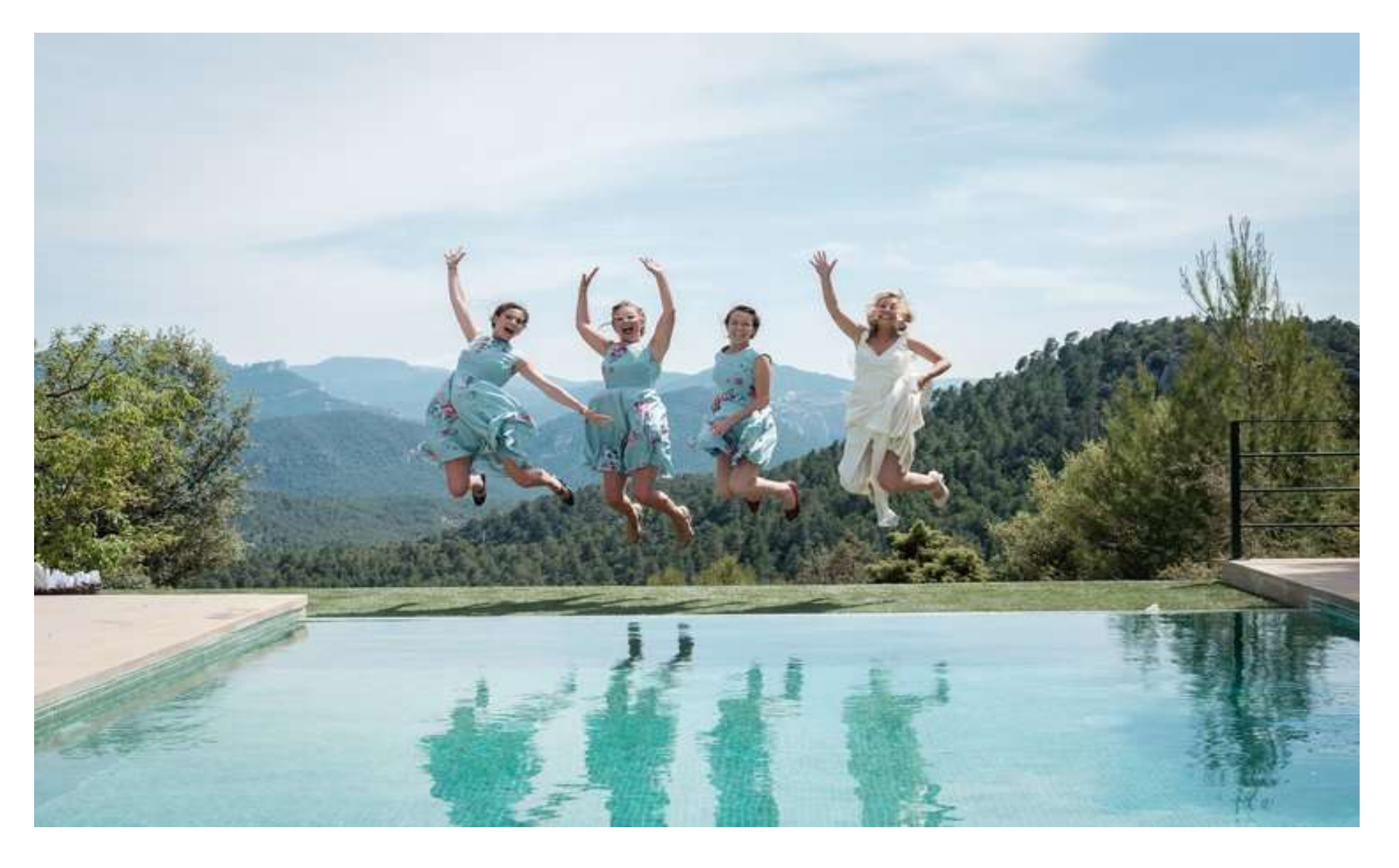
'My wife and I recently celebrated our wedding with a small number of family and friends at Mas de la Serra. We rented the whole property for a week and the result was nothing short of spectacular. The views from the property are breathtaking in every direction.'